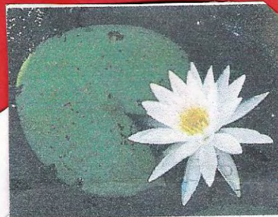
at Water Lily